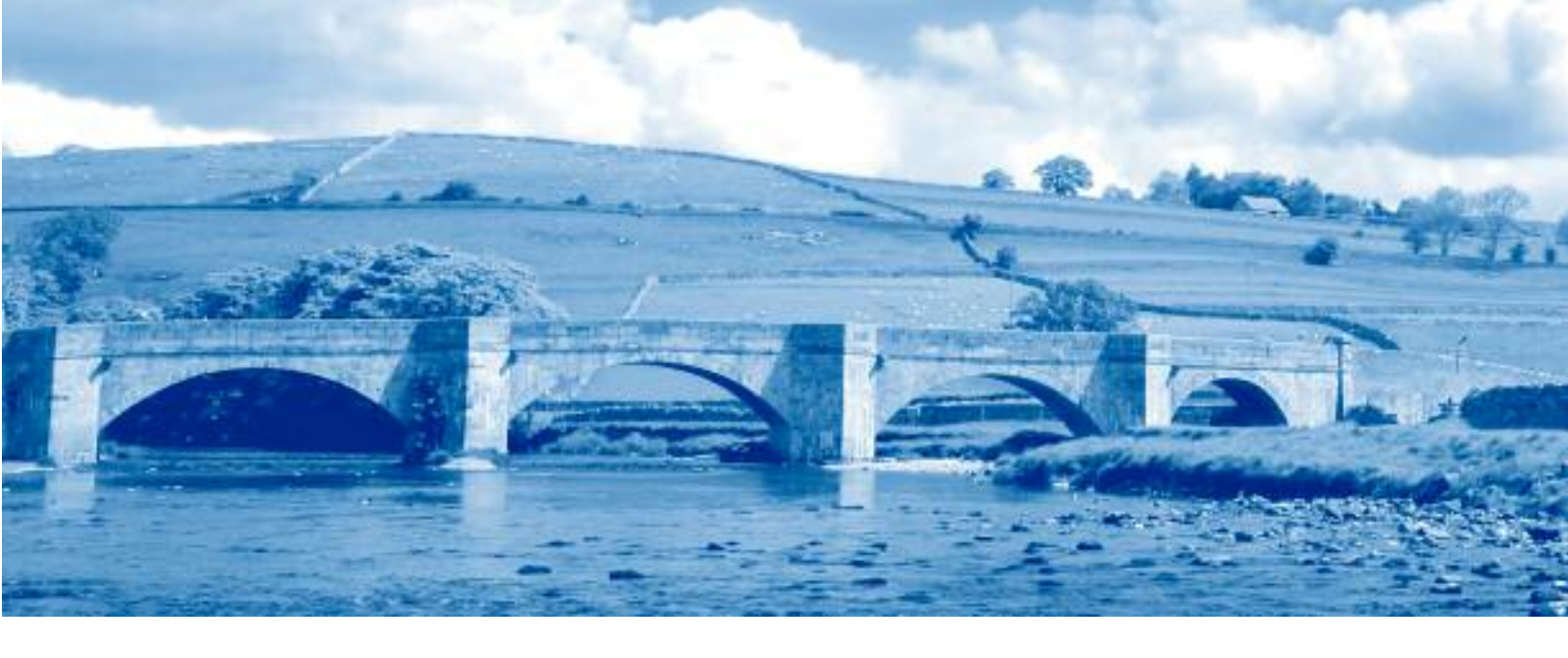
Top 10 Split Trust